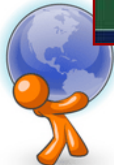
Night Sky Network (NSN)